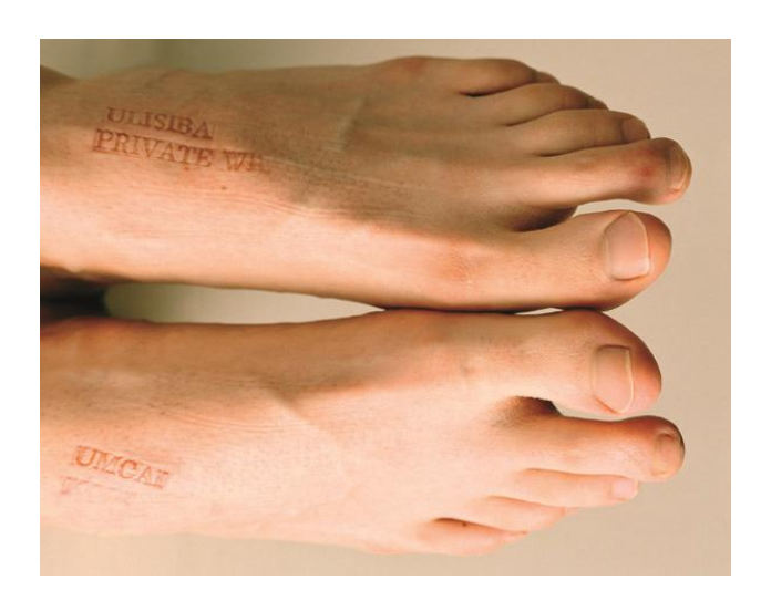
Figure 5c: Paul Emmanuel's detail of embossed text into the artist's flesh from The Lost Men Project (Grahamstown) (2006).

When withdrawn after a few minutes, a photograph was taken before the impression disappeared. The embossed text and the read names of the dead are what one views and hears on each page of the work. After touching the screen, a new page is revealed causing the remaining impressions of these names to slowly fade away.