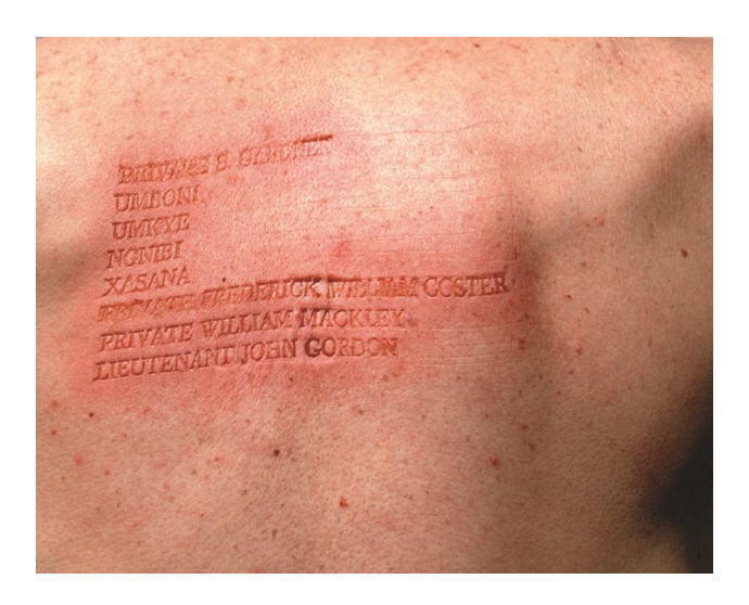
Figure 5b: Paul Emmanuel's detail of embossed text into the artist's flesh from The Lost Men Project (Grahamstown) (2006).