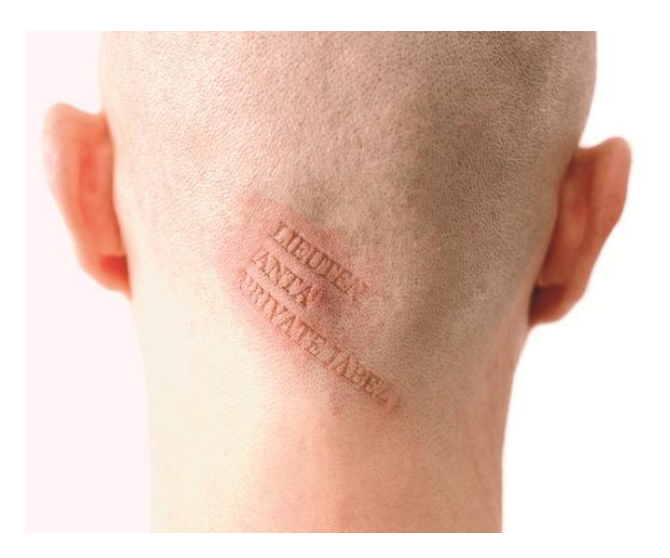
Figure 5a: Paul Emmanuel's detail of embossed text into the artist's flesh from The Lost Men Project (Grahamstown) (2006).

This 'complex interplay' is revealed as a content-generating device in the work when the reader/viewer responds to the verbal invitation to touch the screen. The names of young men who died in the Frontier Wars fought in the Grahamstown area in the 1820s and 50s were set in lead type and pressed directly and painfully into Emmanuel's skin (Figures 5a, 5b & 5c).