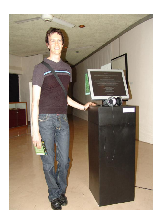
Figure 3: Paul Emmanuel's The Lost Men Project (Grahamstown) (2006). Touch screen animation and headphones on pedestal.